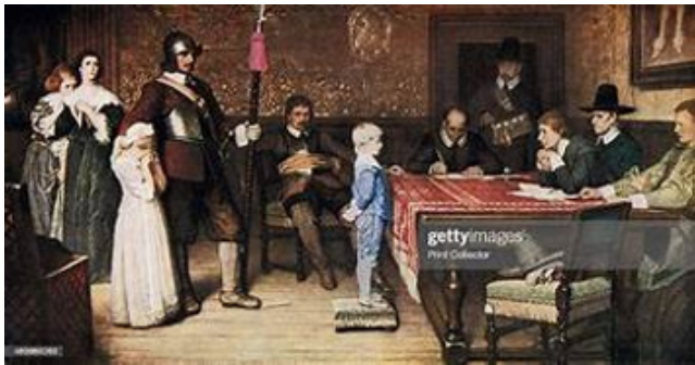
“When did you last see your father?” painted by William Frederick Yeames, 1878